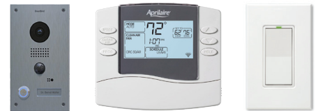
Standard Package Items: ELAN Controller, video doorbell, smart thermostat, lighting dimmers