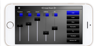
ELAN climate and lighting control