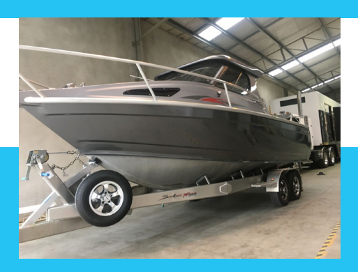
Benefits of Nano-Clear on your marine asset:

Nano-Clear has out-performed all other protective coating products on a range of aspects including UV resistance, salt fog, water immersion, pencil hardness and abrasion resistance. Research shows that every time you clean and polish your boat, you are actually breaking down the existing coating of your vessel – leading to fading, staining and oxidisation.