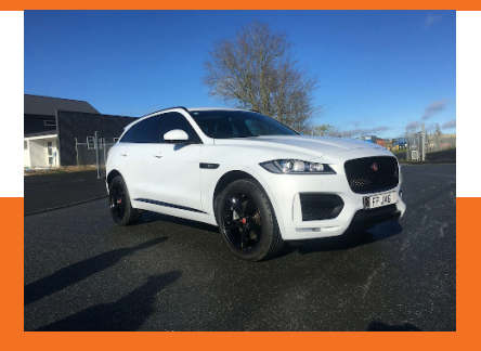
Nano-Clear provides permanent protection for private and commercial vehicles:

A lot of time, energy and money can be spent cleaning and maintaining vehicles. They are generally well used assets that face a continual battering from abrasion and corrosion. Nano-Clear dramatically improves surface protection, significantly reducing maintenance time and expenses. Providing a clear coat layer that is six times harder than paint, the usual causes of surface damage – chemicals, UV, corrosion, abrasion – are literally washed away with a hose.